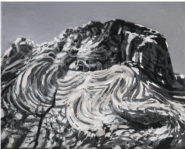
Tuca Culebres. Oil on canvas, 24 x 30 cm, 2015 →