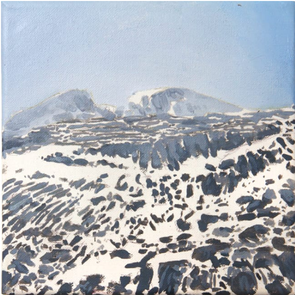
Monte Perdido II. Oil on canvas, 20 x 20 cm, 2016 →