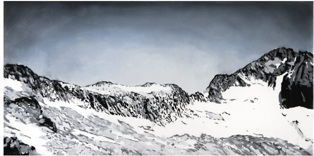
Pico Coronas. Oil on canvas, 40 x 80 cm, 2015 →