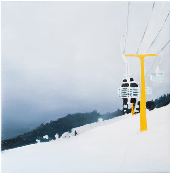
Cerler - Sessellift. Oil on canvas, 40 x 40 cm, 2015 →