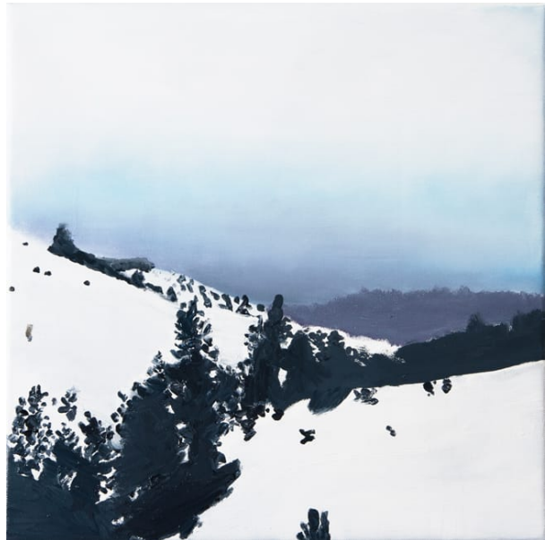
Cerler - Waldland. Oil on canvas, 40 x 40 cm, 2015 →