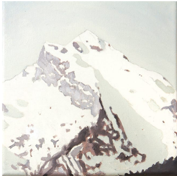
Summit. Oil on canvas, 20 x 20 cm, 2016 →