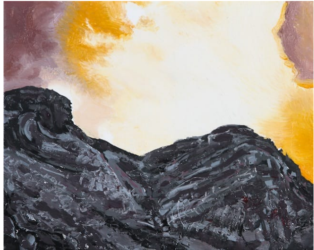
Picos Vallibierna. Oil on canvas, 24 x 30 cm, 2015 →