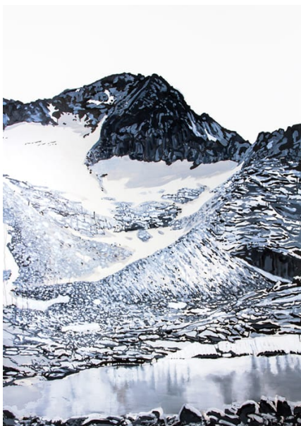
Aneto, Big. Oil on canvas, 200 x 150 cm, 2015 →