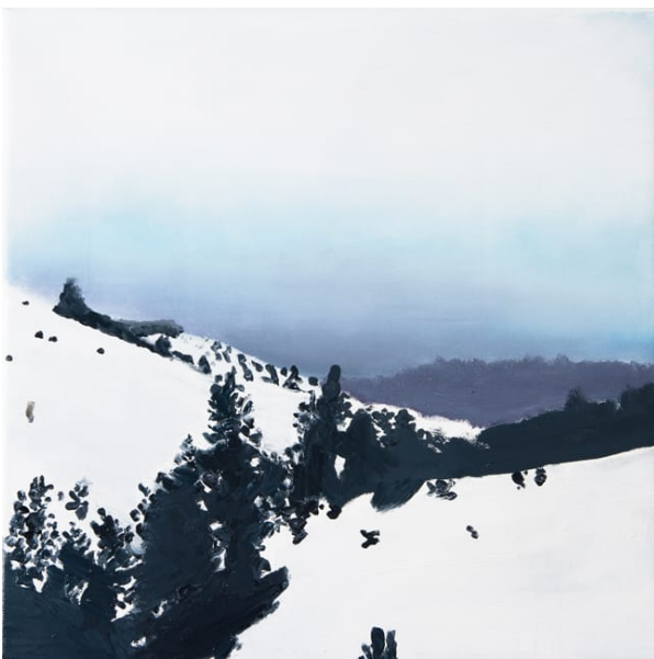
Cerler - Waldland. Oil on canvas, 40 x 40 cm, 2015 →