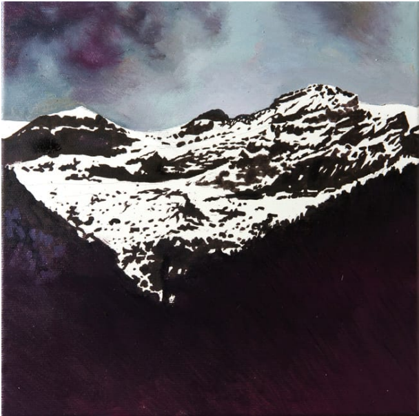
Monte Perdido I. Oil on canvas, 30 x 30 cm, 2016 →