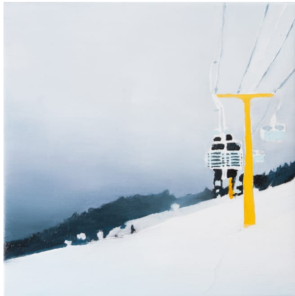
Cerler - Sessellift. Oil on canvas, 40 x 40 cm, 2015 →