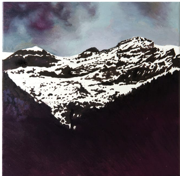
Monte Perdido I. Oil on canvas, 30 x 30 cm, 2016 →