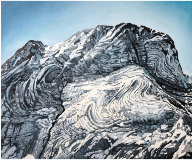
Tuca Culebres, Big. Oil on canvas, 100 x 120 cm, 2016 →