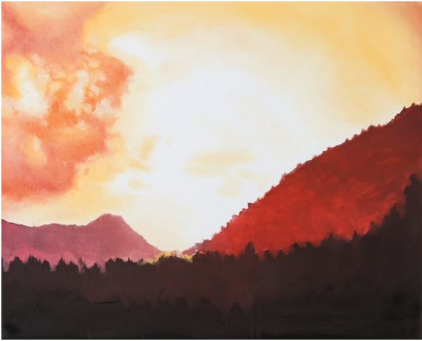
Vallibierna Sunset. Oil on canvas, 40 x 50 cm, 2015 →