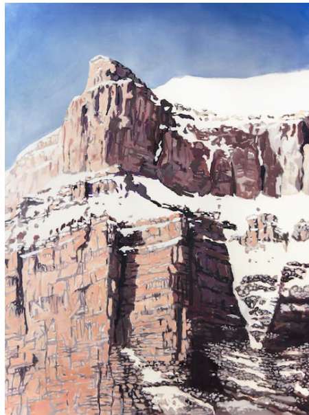
Ordesa I. Acrylic on canvas, 100 x 80 cm, 2016 →