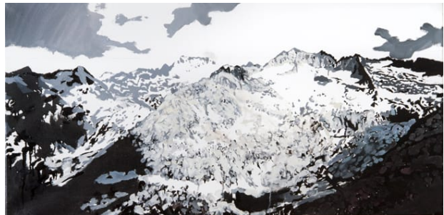
Maladeta. Oil on canvas, 40 x 80 cm, 2015 →