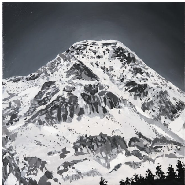
Tuca Arnau. Oil on canvas, 40 x 40 cm, 2015 →