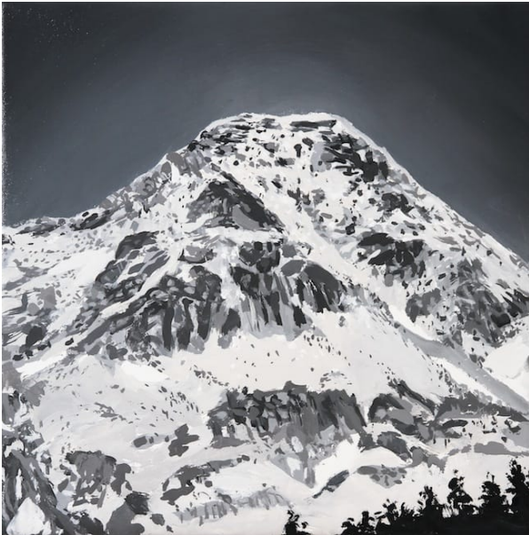
Tuca Arnau. Oil on canvas, 40 x 40 cm, 2015 →