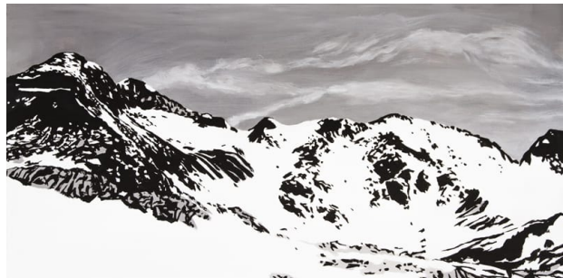
Perdiguer Peak. Acrylic on paper, 80 x 160 cm, 2017 →