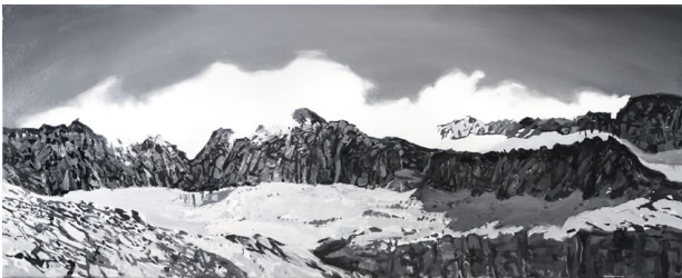
Picos Malditos. Oil on canvas, 40 x 100 cm, 2015 →