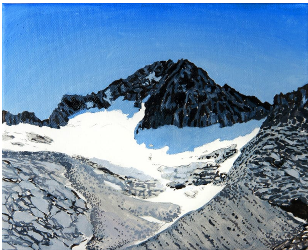
Aneto. Oil on canvas, 24 x 30 cm, 2016 →