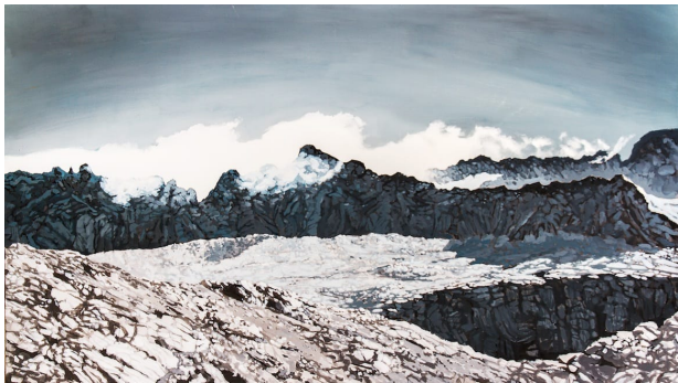
Picos Malditos, Big. Acrylic on canvas, 110 x 200 cm, 2016 →