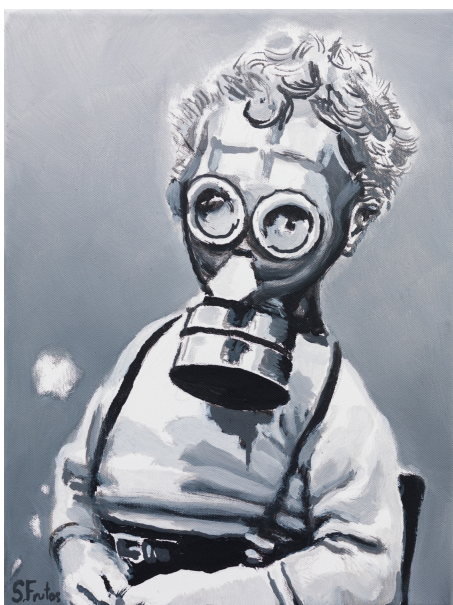
Little Portrait. Acrylic on canvas, 40 x 30 cm, 2022 →