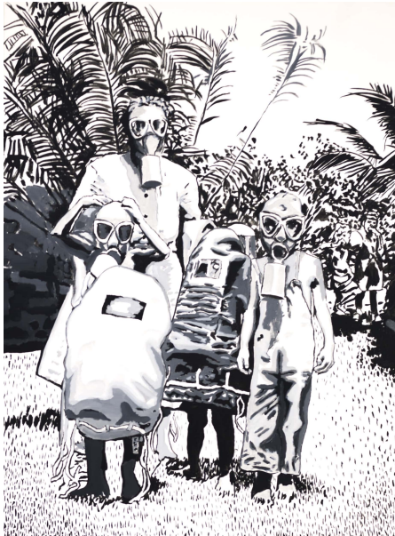
Tropical Family. Acrylic on canvas, 130 x 100 cm, 2023 →