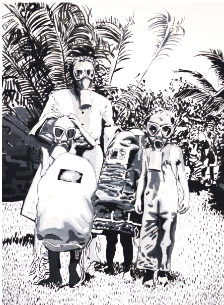
Tropical Family. Acrylic on canvas, 130 x 100 cm, 2023 →