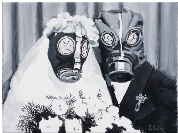
Just Married. Acrylic on canvas, 30 x 40 cm, 2022 →