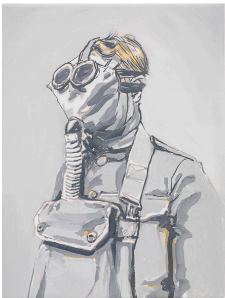
Practical Physics. Oil on canvas, 40 x 30 cm, 2020 →