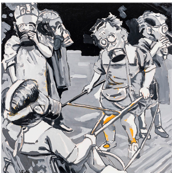
Masks at Play. Oil on canvas, 50 x 50 cm, 2020 →