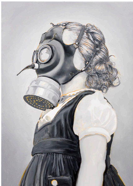
Children's Gas Mask. Oil on canvas, 140 x 100 cm, 2020 →