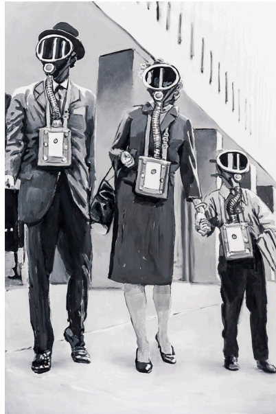
The future is here. Oil on canvas, 180 x 120 cm, 2020 →