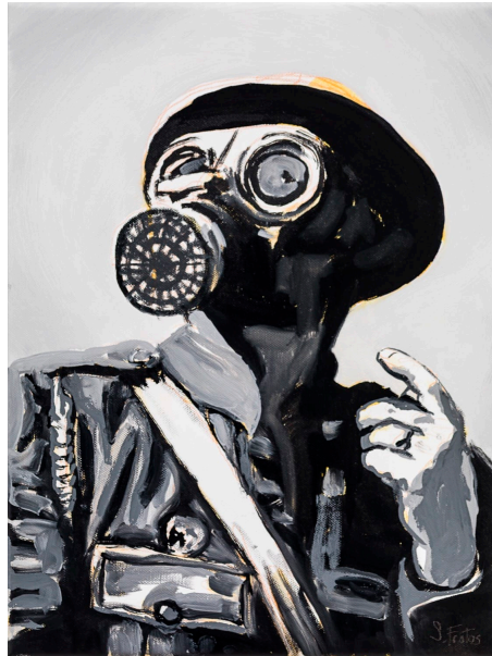
Air Raid Warden. Oil on canvas, 40 x 30 cm, 2020 →