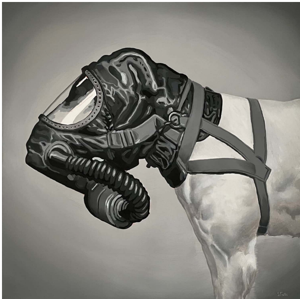
US War Dogs I. Acrylic on canvas, 130 x 130 cm, 2025 →