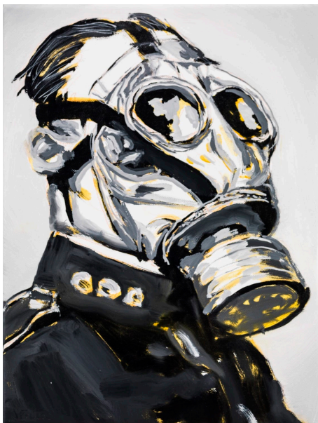
Chemical Development Section. Oil on canvas, 40 x 30 cm, 2020 →