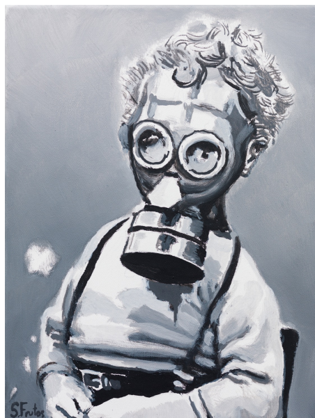
Little Portrait. Acrylic on canvas, 40 x 30 cm, 2022 →