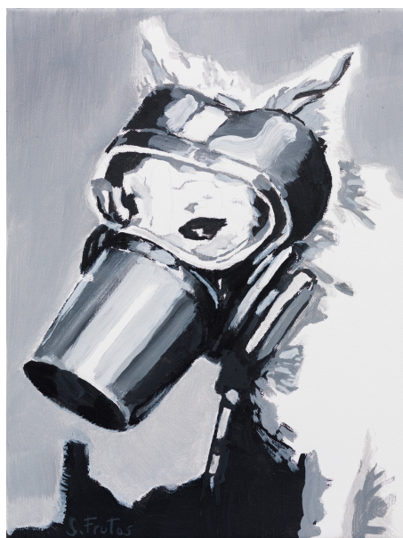
Dog Squad. Acrylic on canvas, 40 x 30 cm, 2022 →