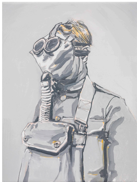
Practical Physics. Oil on canvas, 40 x 30 cm, 2020 →