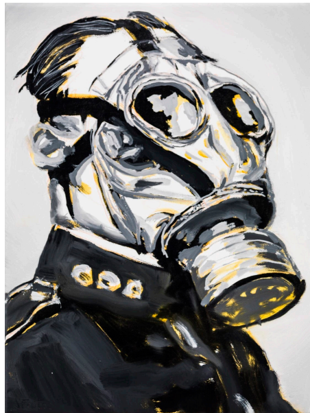
Chemical Development Section. Oil on canvas, 40 x 30 cm, 2020 →