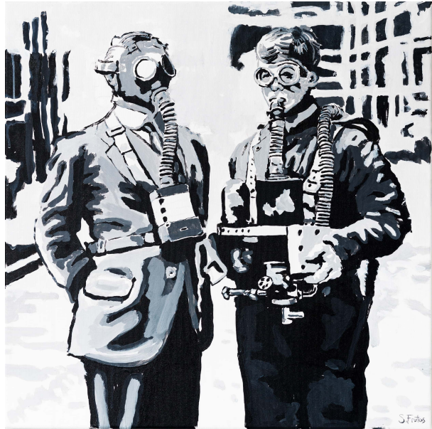
Presentation. Acrylic on canvas, 50 x 50 cm, 2022 →