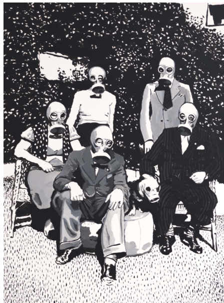
Day at the garden. Acrylic on canvas, 130 x 100 cm, 2023 →