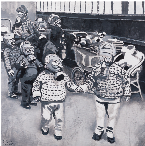
School Break. Acrylic on canvas, 50 x 50 cm, 2022 →