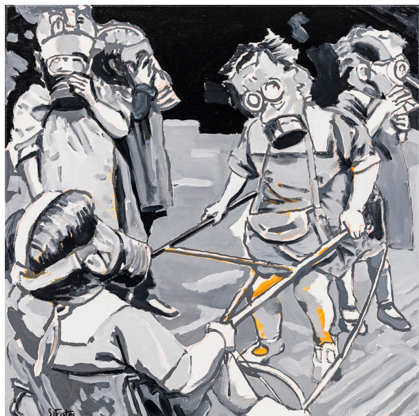
Masks at Play. Oil on canvas, 50 x 50 cm, 2020 →