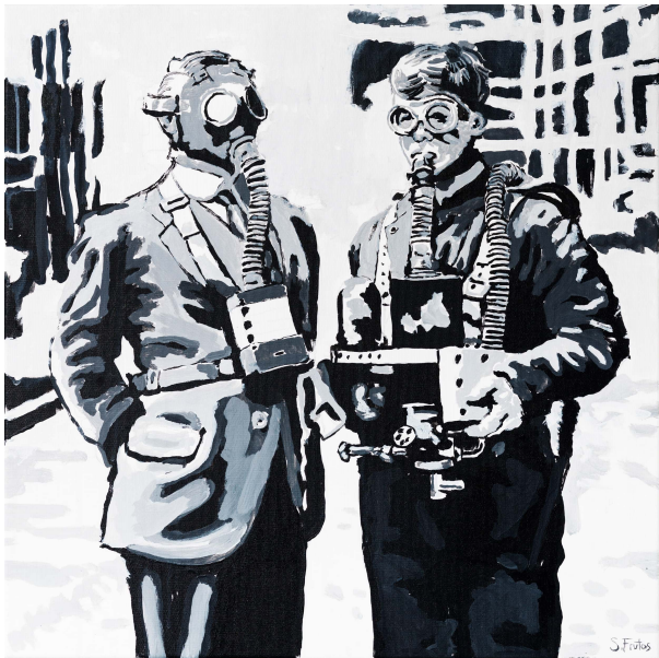
Presentation. Acrylic on canvas, 50 x 50 cm, 2022 →