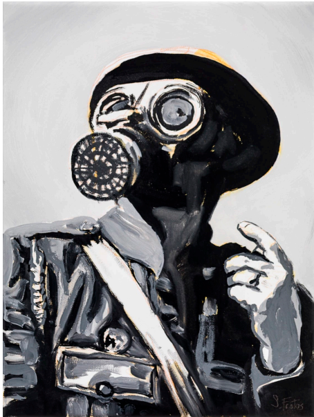
Air Raid Warden. Oil on canvas, 40 x 30 cm, 2020 →