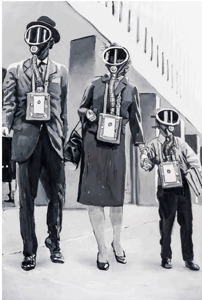
The future is here. Oil on canvas, 180 x 120 cm, 2020 →