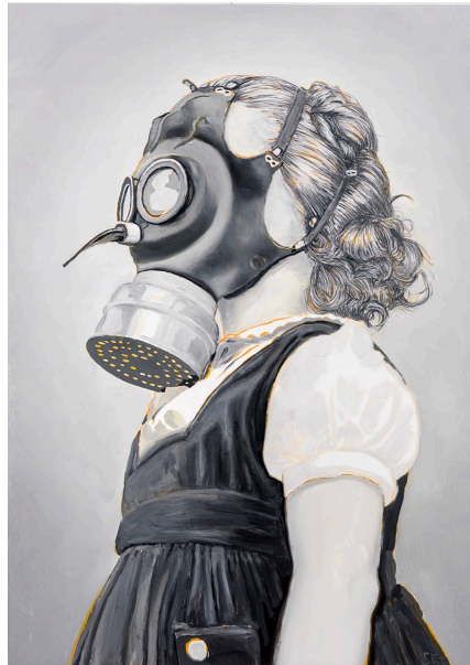
Children's Gas Mask. Oil on canvas, 140 x 100 cm, 2020 →