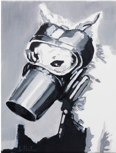
Dog Squad. Acrylic on canvas, 40 x 30 cm, 2022 →