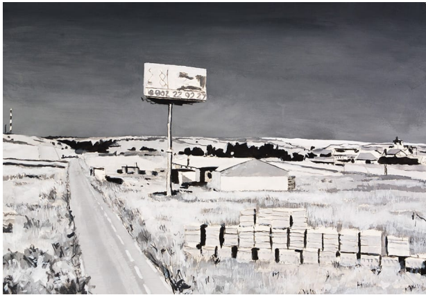
Field, Countryside. Gouache on paper, 70 x 100 cm, 2013 →