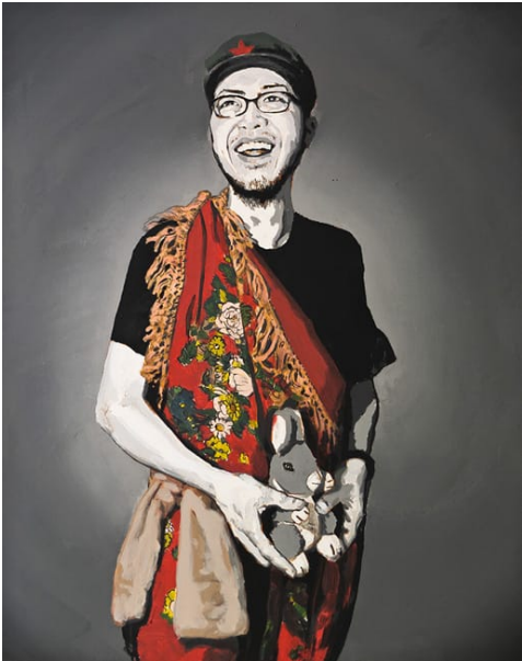
Herr Zhang. Acrylic on canvas, 100 x 80 cm, 2013 →