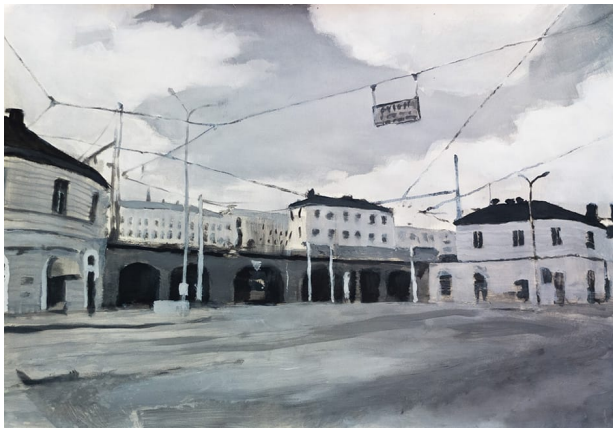
Brno. Gouache on paper, 70 x 100 cm, 2013 →