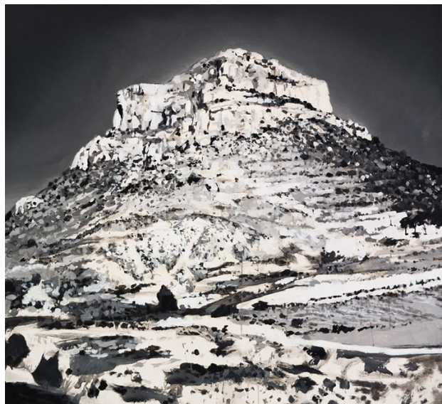
Mesa. Acrylic on canvas, 120 x 130 cm, 2013 →