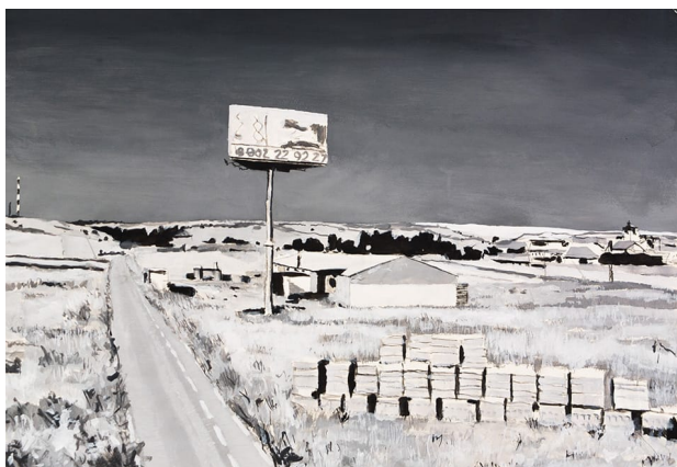
Field, Countryside. Gouache on paper, 70 x 100 cm, 2013 →