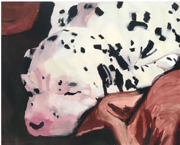
Dalmata. Oil on canvas, 80 x 100 cm, 2013 →