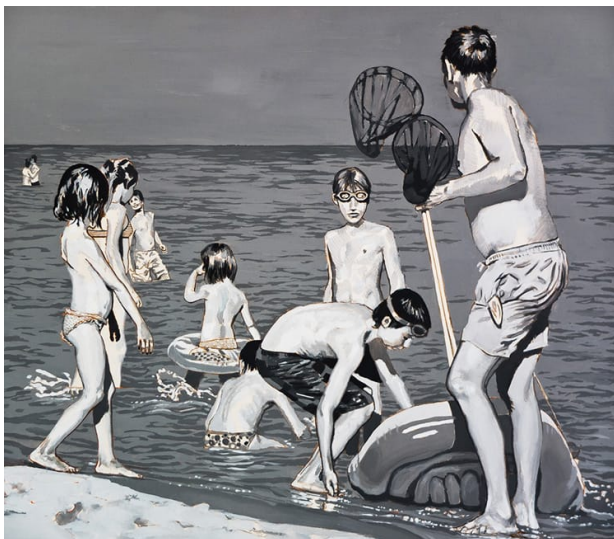
Strand I. Acrylic on canvas, 140 x 160 cm, 2013 →