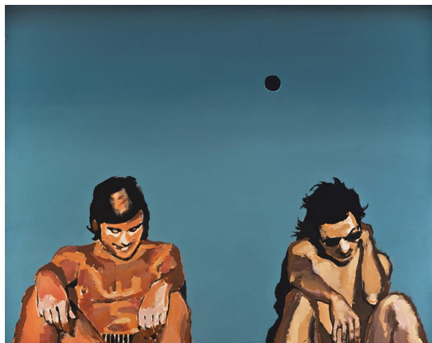
Swimming Pool I. Acrylic on canvas, 100 x 80 cm, 2013 →