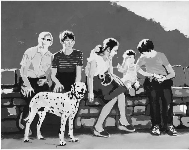
Peña Oroel, 1984. Acrylic on canvas, 80 x 100 cm, 2015 →