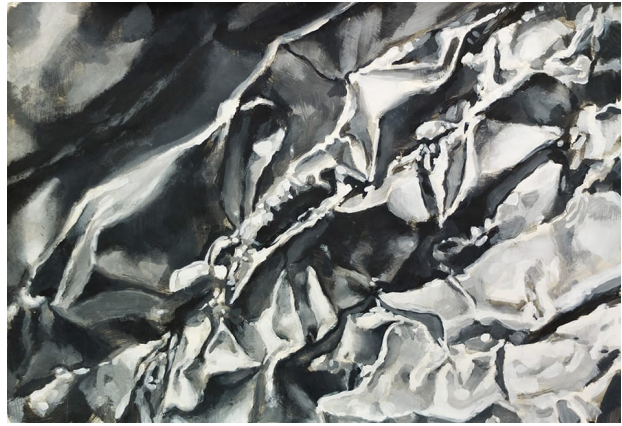
Aluminium Foil. Gouache on paper, 70 x 100 cm, 2013 →