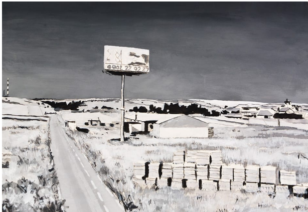
Field, Countryside. Gouache on paper, 70 x 100 cm, 2013 →

Images from old familiar albums, travel pictures and contemporary portraits of artists articulate a dialogue between narratives.