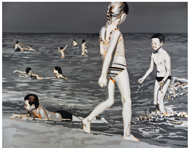
Strand II. Acrylic on canvas, 80 x 100 cm, 2013 →