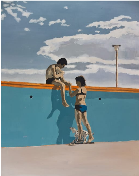
Swimming Pool II. Acrylic on canvas, 80 x 100 cm, 2013 →