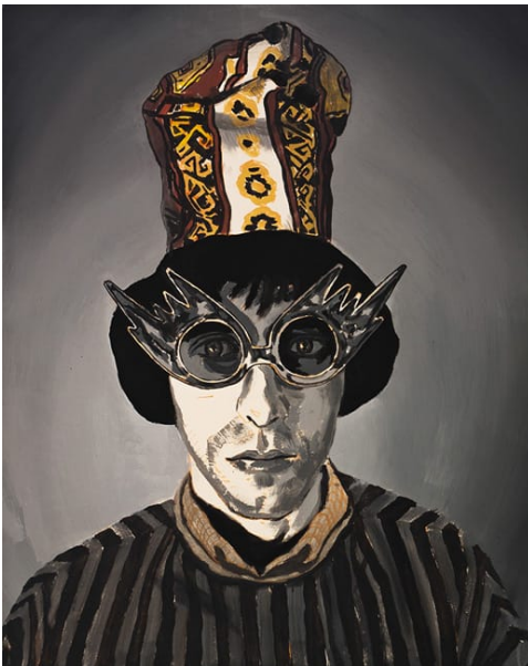
Mr Leapman. Acrylic on canvas, 100 x 80 cm, 2013 →