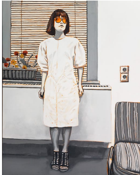
Merry Kings. Acrylic on canvas, 100 x 80 cm, 2013 →