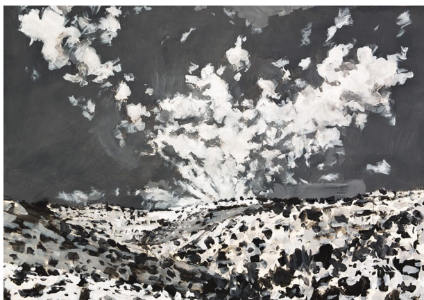
Creek. Gouache on paper, 70 x 100 cm, 2013 →