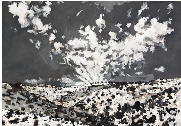
Creek. Gouache on paper, 70 x 100 cm, 2013 →