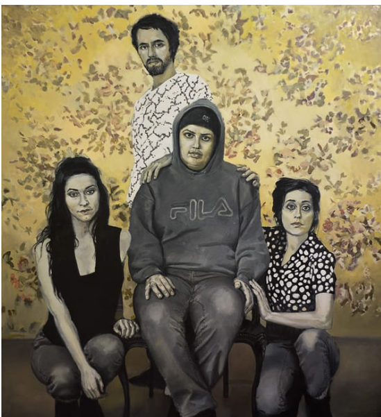
The Strange Family. Oil on canvas, 200 x 180 cm, 2013 →