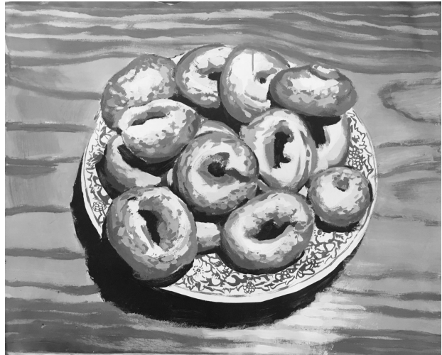
Rosquillas. Oil on canvas, 80 x 100 cm, 2015 →