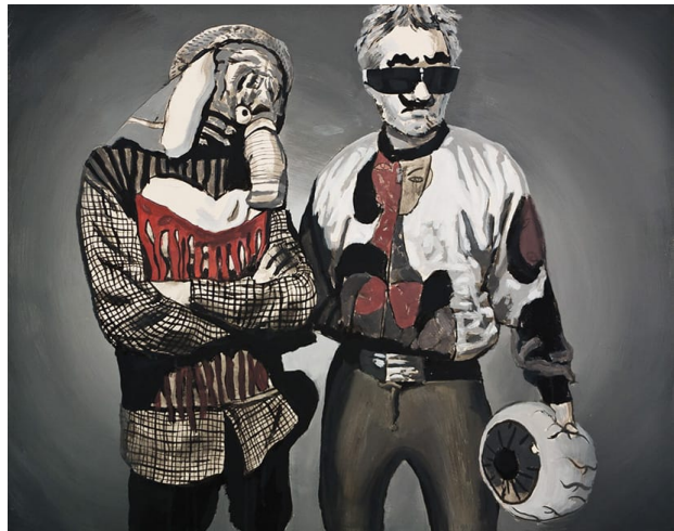
Neue Helden. Acrylic on canvas, 80 x 100 cm, 2013 →