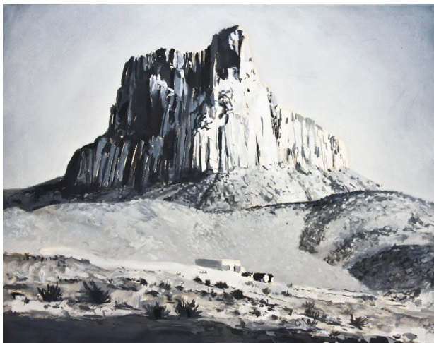
Ahaggar. Oil on canvas, 80 x 100 cm, 2014 →