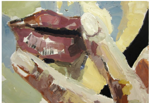
Live Show 10. Oil on wood, 42 x 60 cm, 2011 →