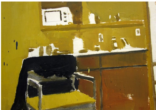
Live Show 17. Oil on wood, 42 x 60 cm, 2011 →