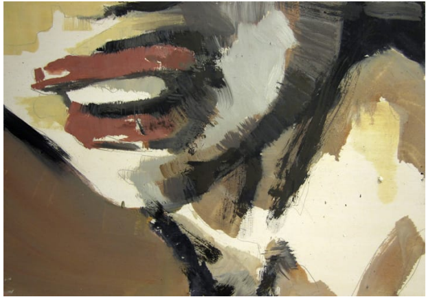
Live Show 14. Oil on wood, 42 x 60 cm, 2011 →