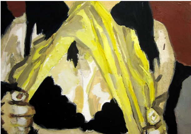
Live Show 03. Oil on wood, 42 x 60 cm, 2011 →