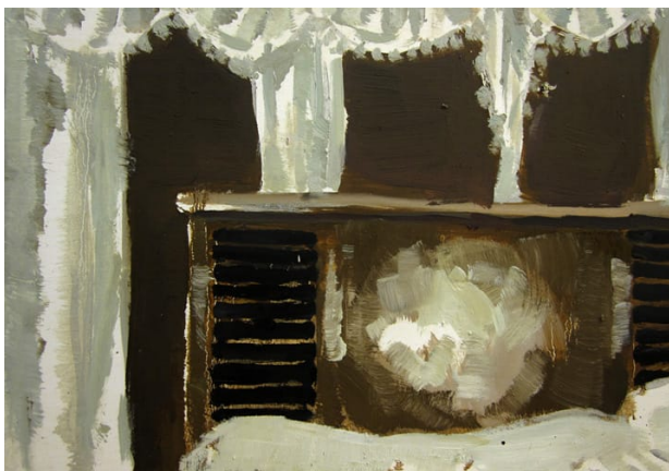
Live Show 19. Oil on wood, 42 x 60 cm, 2011 →