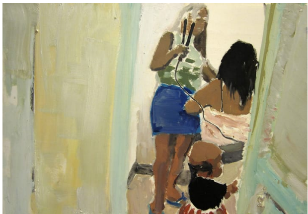
Live Show 18. Oil on wood, 42 x 60 cm, 2011 →