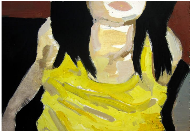
Live Show 04. Oil on wood, 42 x 60 cm, 2011 →