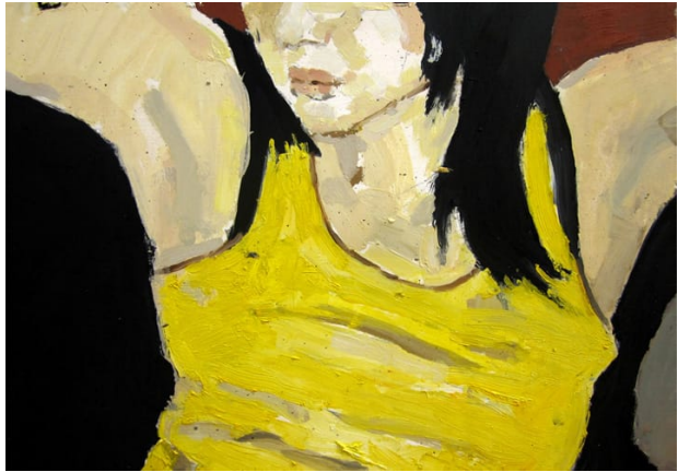
Live Show 02. Oil on wood, 42 x 60 cm, 2011 →