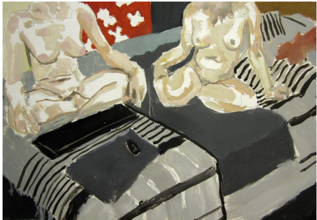
Live Show 16. Oil on wood, 42 x 60 cm, 2011 →