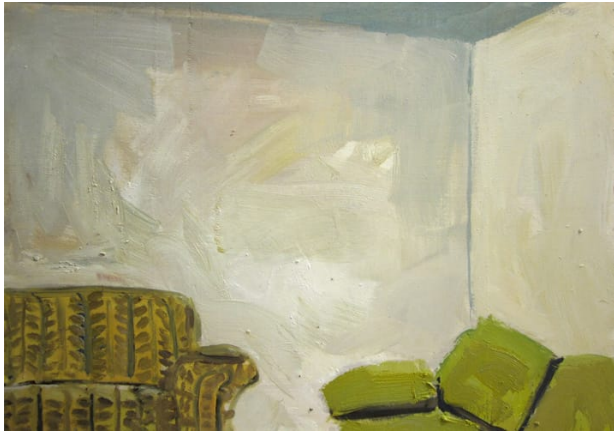
Live Show 13. Oil on wood, 42 x 60 cm, 2011 →