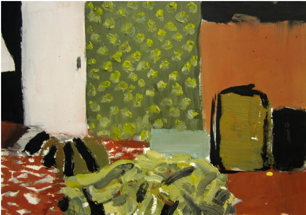
Live Show 07. Oil on wood, 42 x 60 cm, 2011 →