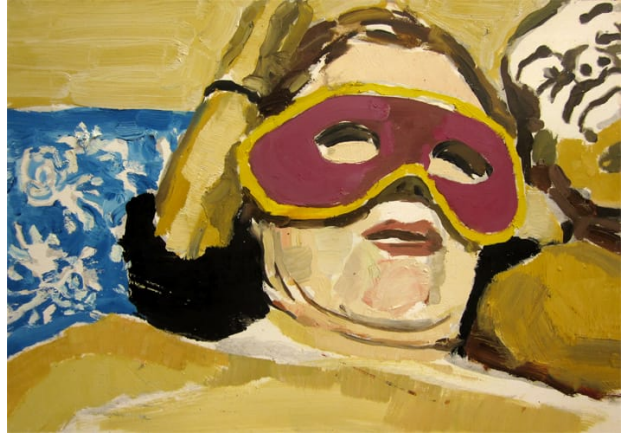
Live Show 06. Oil on wood, 42 x 60 cm, 2011 →