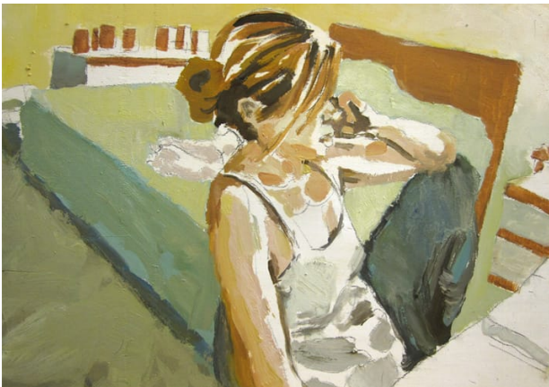
Live Show 09. Oil on wood, 42 x 60 cm, 2011 →