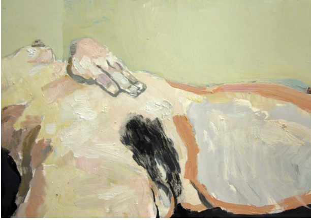
Live Show 05. Oil on wood, 42 x 60 cm, 2011 →