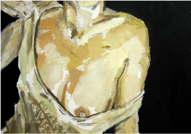
Live Show 01. Oil on wood, 42 x 60 cm, 2011 →