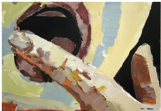
Live Show 12. Oil on wood, 42 x 60 cm, 2011 →