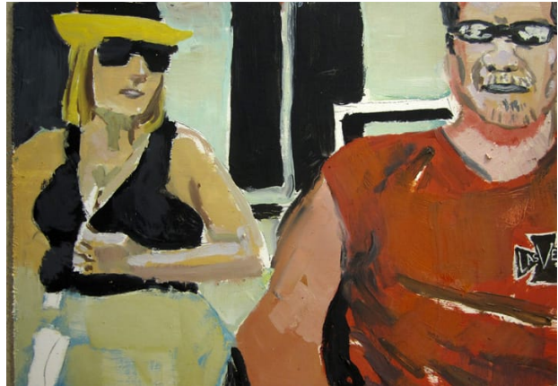
Live Show 08. Oil on wood, 42 x 60 cm, 2011 →