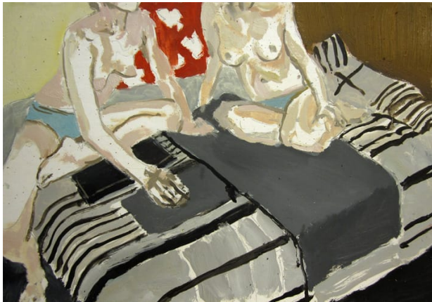
Live Show 15. Oil on wood, 42 x 60 cm, 2011 →