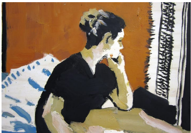
Live Show 20. Oil on wood, 42 x 60 cm, 2011 →